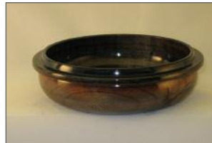
Teal Lake Turner