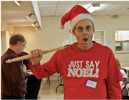
Third Place Noel Beach