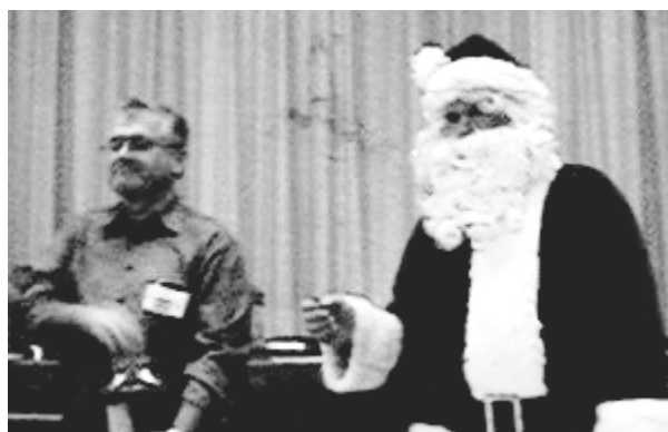
A Real Santa this year