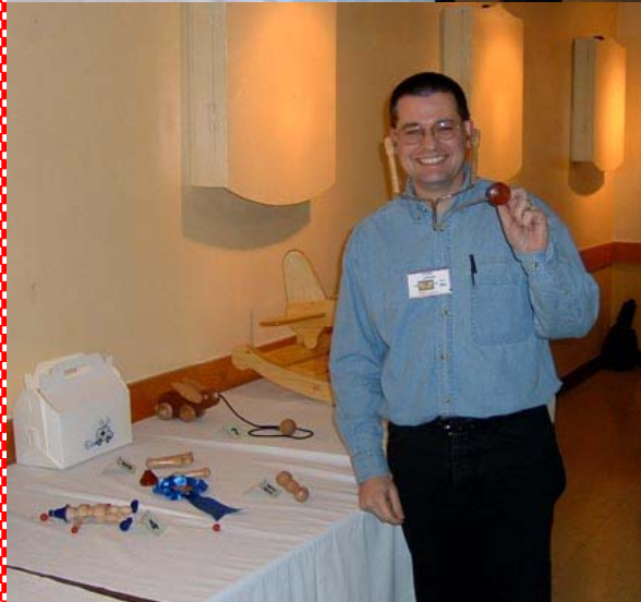
3rd – A medical equipment set created by Robin LeSage.