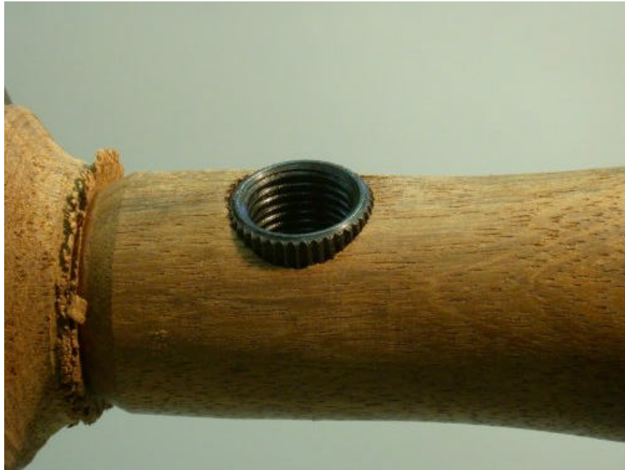
Lee Valley Insert Mounted Insert (P/N 25K62.20)

I drilled the 5/8" hole in the square stock before mounting on the lathe, so that I could center it precisely. Turn the dowel so that you have the diameter of the tool post correct, in this case 1" and the height of the bushing slightly higher than the finished height. This will allow a more precise adjustment sneaking up on the final height. I have a long 1/8" brad point bit so I mounted the 1/8" bushing and determined how much more I had to remove from the shoulder to allow the mount to be exactly centered.