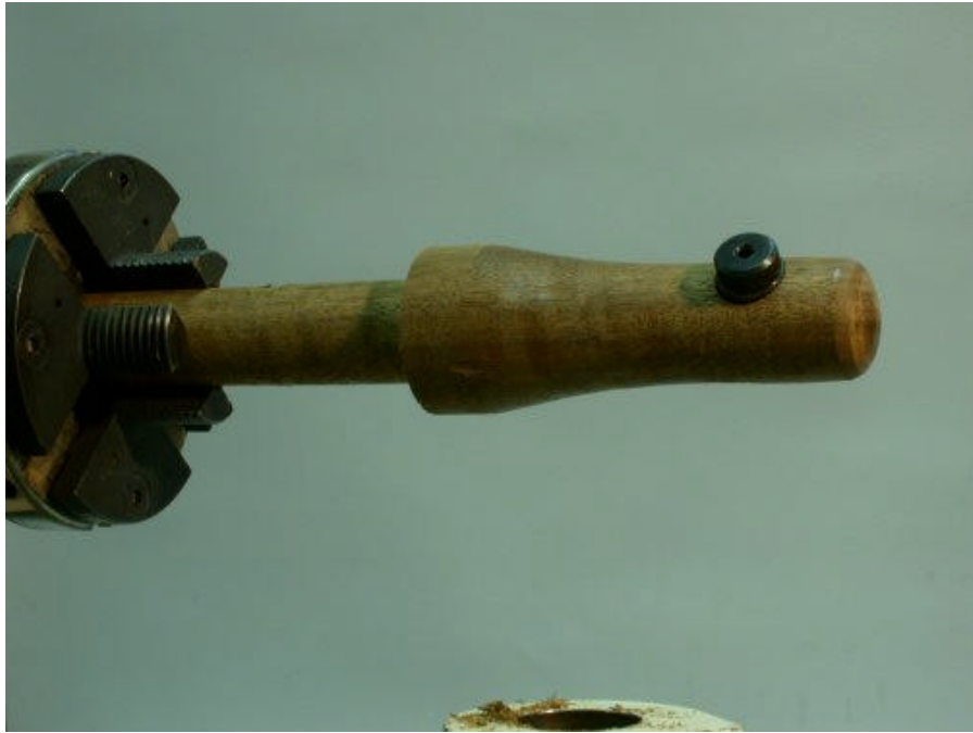
Shown reverse mounted in chuck for last finishing stage

This is a simple jig to make that involves two critical dimensions, the height from the top of the banjo to the center of the bushing and the diameter for mounting in the banjo. I used the Lee Valley Drill Bushing (P/N 25K62.02 - .06) and Insert (P/N 25K62.20) mounted in what is essentially a hardwood dowel turned from some 1 1/2" square stock. First determine the height from the top of the banjo post to the centerline of the lathe. I measured by adjusting a tool rest mounted exactly to center height then using a plastic caliper, resting the end of the caliper on the tool rest and pushing the steel center wire of the caliper down to the top of the banjo. The Lee Valley Bushing Insert requires a 5/8" diameter hole to mount it.